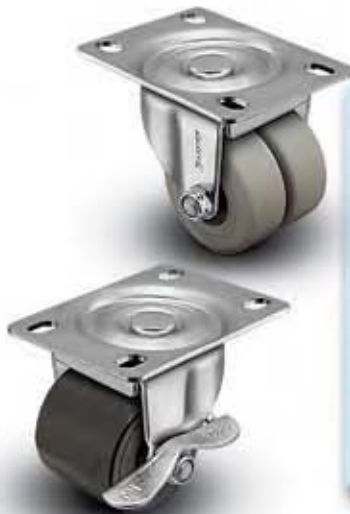
Side Lock Brake Swivel radius is 2-5/16". Add [B] at end of model.