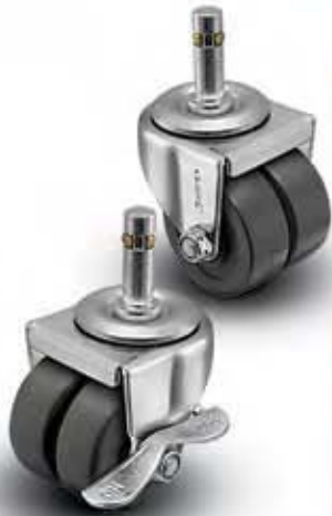
Side Lock Brake Swivel radius is 2-5/16". Add [B] at end of model.