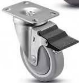
Top Lock Brake Add [TL] at end of model. Swivel radius 4-3/8".