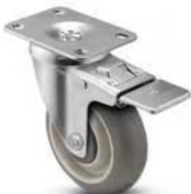
Total Lock Brake Change 3rd digit to "T". Swivel radius 4-3/8". Example: PGT30120ZN-TPR11(GG).

*To order 4" and 5" TPR ball bearing wheels less thread guard change 15th digit to "1" Example PGS401201ZN-TPR21(GG).