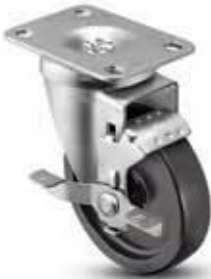
Tread Lock Brake Add [TB] at end of model.