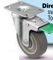
Direction Lock Locks wheel swivel only, does not brake wheel. To order change 3rd digit to "D" (5" model only. Swivel radius is 4-3/8"). Example: PGD50120ZN-TPR21GG