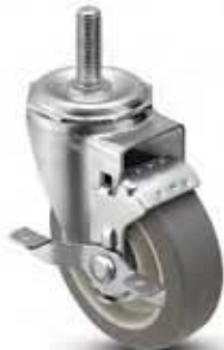
Tread Lock Brake Add [TB] at end of model.