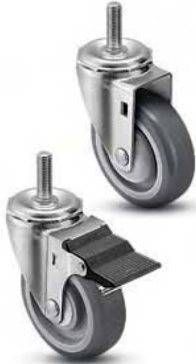
Top Lock Brake Add [TL] at end of model. Swivel radius 4-3/8".