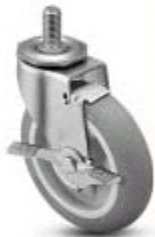
Tread Lock Brake 4" and 5" models. Add [-B] at end of model.