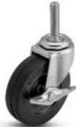
Friction Brake 2", 2-1/2" & 3" models. 2" and 2-1/2" dia. model swivel radius changes to 2-1/4". Add [-B] at end of model.