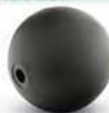
2" Spherical Polyolefin