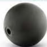
1-5/8" Spherical Soft Rubber