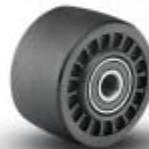
Glass Filled Nylon