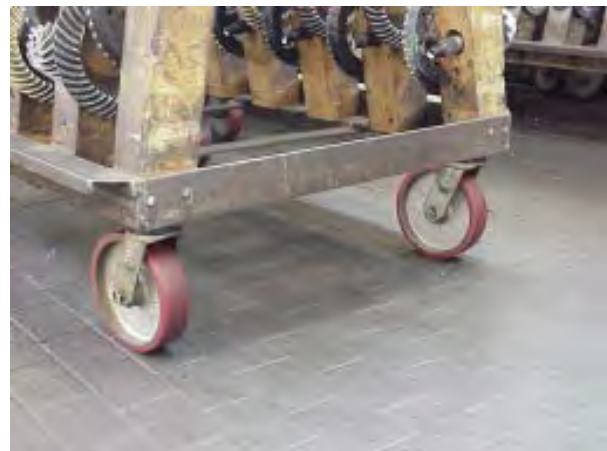
Spindle rack for gear blanks. T/R compound soft polyurethane is floor protective and will not pick up machine shavings or debris.

Excellent for dollies, waste disposal trucks, warehouse trucks, proof or cooling racks, portable work benches, floor trucks, shop carts, drywall dollies, trailer frames, wire shelving units, tool boxes, laundry distribution carts, manual lifting devices, unitized dairy distribution carts and other medium duty applications.