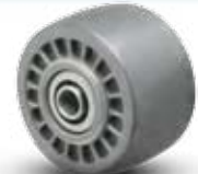
Urethane Anti-Static (55-65 Shore D Durometer) (3" models)