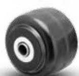
Phenolic (2-3/8" and 3" models)