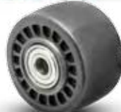
Glass Filled Nylon (3" models)