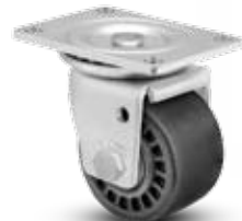
3" Swivel Model