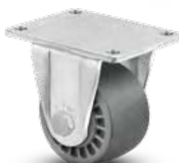
3" Rigid Model