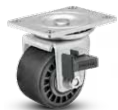
Sure-Lok Brakes available on 3" models.