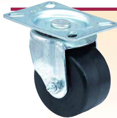
SERIES 1F58 Double Row Swivel Plate Caster (1F5803027000197)