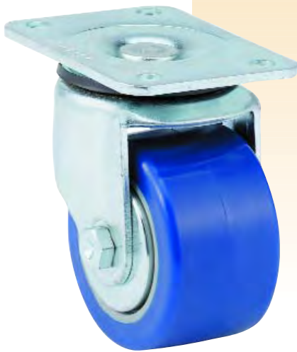
SERIES 1F58 Swivel Plate Caster with Thread Guards (1F5803K25001100)