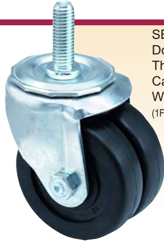
SERIES 1F59 Double Row Swivel Threaded Stem Caster with Dual Wheel (1F5903704000110)