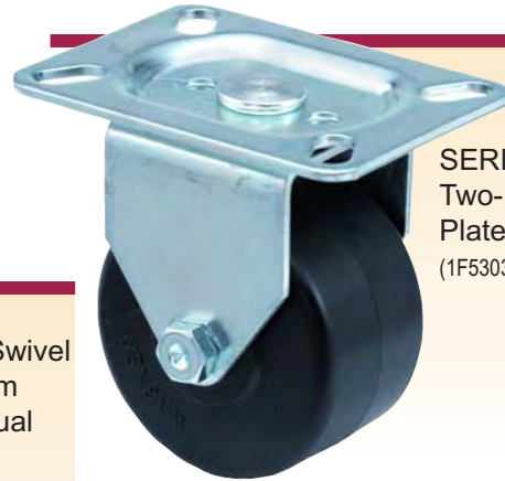
SERIES 1F53 Two-Piece Rigid Plate Caster (1F5303027000197)